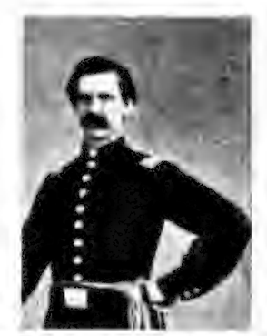
POST DEUT TRANCES E. DUADRING